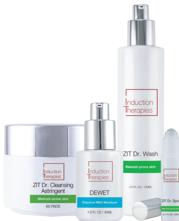
SKU #IT2020 4-Piece Kit