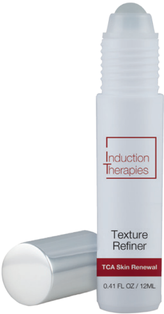
SKU #IT6750 0.41 FL OZ / 12ML