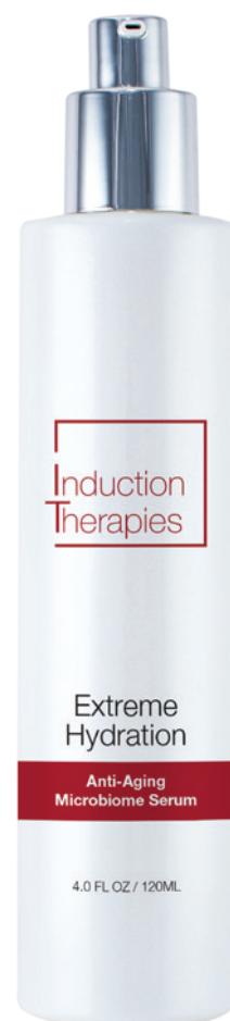
SKU #IT6375 4.0 FL OZ / 120ML